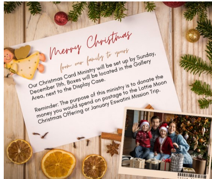
Christmas Card Ministry ~ save postage give to "Lottie Moon"